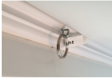
7. Pull down top window. Hook Key Ring onto Eye Hook. Hang Wreath Outside window. Fishing line goes between window and frame