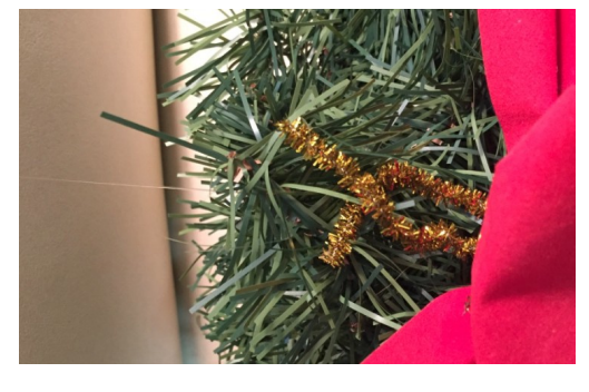
6. Stretch Fishing line to ensure you can Hook Key Ring onto Eye Hook. Attach the ribbon, centered.

3. Measure to center – same spot on each window frame. Secure Drill Bit in power drill & make a hole the depth of your Eye Hook threads.