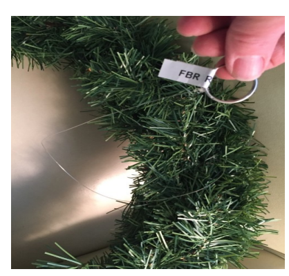
5. Tie Fishing Line on Wreath & on Key Ring. Ensure uniform Length among all wreaths, based on actual Eye-Hook location. Label Ring according to window, as hook location may vary slightly.

3. Measure to center – same spot on each window frame. Secure Drill Bit in power drill & make a hole the depth of your Eye Hook threads.